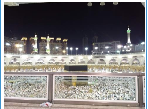
Hajj Tawaf 2018 11 th Annual Hajj Reunion

Jumada Al Awwal was called so because of freezing of water in this phase. It is also a very significant month because the Holy Prophet (PBUH) married His first wife, Hadrat Kadijah (R.A) in it. The Grandfather of Rasulullah (PBUH), Abdul Muttalib, who took great care of him, also died at this time of the year. (Editor's note: Months of the Hijri calendar move through seasons.)