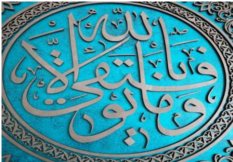
Wall Art: ShukronIslamicArts Read the HOLY QURAN daily. Surah HUD