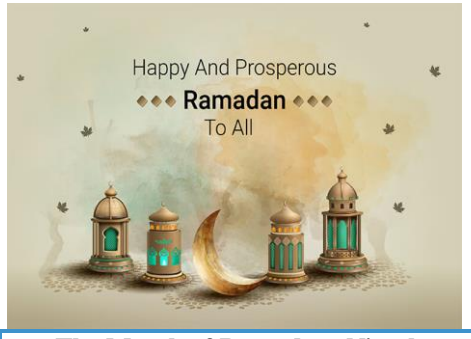
The Month of Ramadan; Nineth Month of the Islamic (Hijri) Calendar

month of Allah. It is the month which invites you to be the guests of Allah and invites you to be one of those near to Him. Each breath you take glorifies Him; your sleep is worship, your deeds are accepted, and your supplications are answered. So, ask Allah, your Lord; to give you a sound body and an enlightened heart so you may be able to fast and recite his book, for only he is unhappy who is devoid of Allah's forgiveness during this great month. Remember the hunger and thirst of the day of Judgment with your hunger and thirst; give alms to the needy and poor, honor your old, show kindness to the young ones, maintain relations with your blood relations; guard your tongues, close your eyes to that which is not permissible for your sight, close your ears to that which is forbidden to hear, show compassion