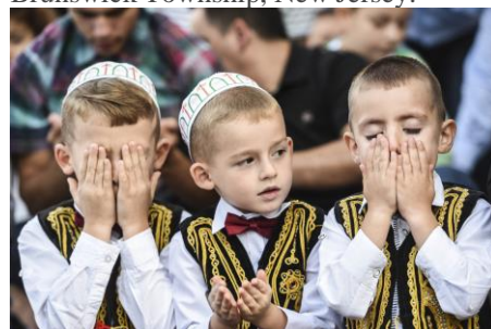
Muslim children from Kosova, Albania.