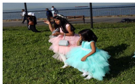
Muslim girls are seen dressed for Eid-ul-Fitr in Bensonhurst Park of Brooklyn borough in New York, United States.