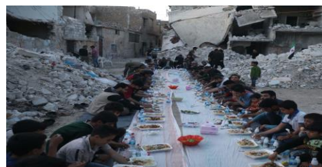
Displaced Syrians break their fast together in a ruined neighborhood