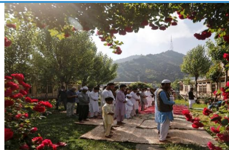
Kashmiri Muslims offer prayers outdoors