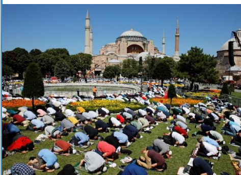
Worshippers in Istanbul observe social distancing while at prayer

"To ALLAH we belong, and to Him is our return". Holy Quran 2:156