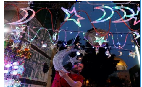
A Palestinian man hangs street decorations in preparation for the holy month

Ramadhan-2021 How Muslim Fasting Month Affected by Coronavirus