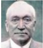
Abdullah Yusuf Ali translation

But when (once) Allah willeth a people's punishment, there can be no turning it back, nor will they find, besides Him, any to protect. Holy Quran 13:11